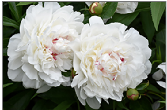
Festiva Maxima Peony flowers