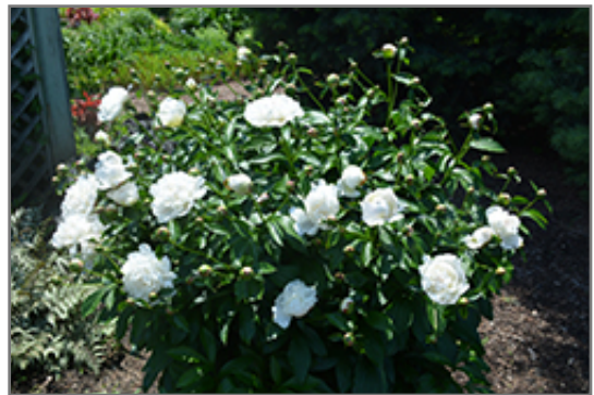
Festiva Maxima Peony in bloom