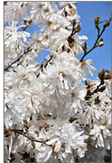
Royal Star Magnolia flowers