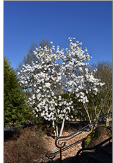
Royal Star Magnolia in bloom