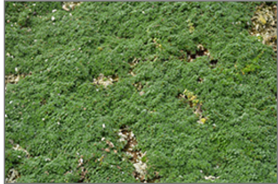
Elfin Creeping Thyme

This plant should only be grown in full sunlight. It prefers to grow in average to dry locations, and dislikes excessive moisture. It is considered to be drought-tolerant, and thus makes an ideal choice for a low-water garden or xeriscape application. It is not particular as to soil type or pH. It is highly tolerant of urban pollution and will even thrive in inner city environments. Consider covering it with a thick layer of mulch in winter to protect it in exposed locations or colder microclimates. This is a selected variety of a species not originally from North America. It can be propagated by division; however, as a cultivated variety, be aware that it may be subject to certain restrictions or prohibitions on propagation.