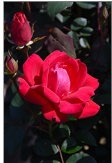
Double Knock Out Rose flowers

Double Knock Out Rose is recommended for the following landscape applications;