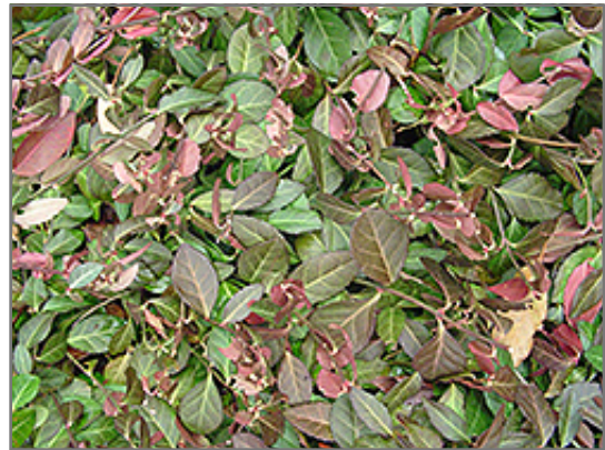
Purpleleaf Wintercreeper foliage

Purpleleaf Wintercreeper is recommended for the following landscape applications;