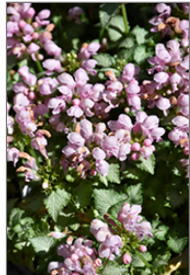
Pink Pewter Spotted Dead Nettle flowers

Pink Pewter Spotted Dead Nettle is recommended for the following landscape applications;