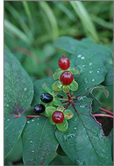
Albury Purple St. John's Wort fruit

Albury Purple St. John's Wort makes a fine choice for the outdoor landscape, but it is also well-suited for use in outdoor pots and containers. With its upright habit of growth, it is best suited for use as a 'thriller' in the 'spiller-thriller-filler' container combination; plant it near the center of the pot, surrounded by smaller plants and those that spill over the edges. It is even sizeable enough that it can be grown alone in a suitable container. Note that when grown in a container, it may not perform exactly as indicated on the tag - this is to be expected. Also note that when growing plants in outdoor containers and baskets, they may require more frequent waterings than they would in the yard or garden.