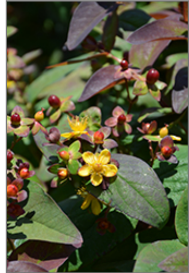
Albury Purple St. John's Wort flowers