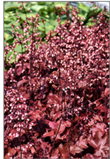
Fire Chief Coral Bells flowers

Fire Chief Coral Bells is recommended for the following landscape applications;