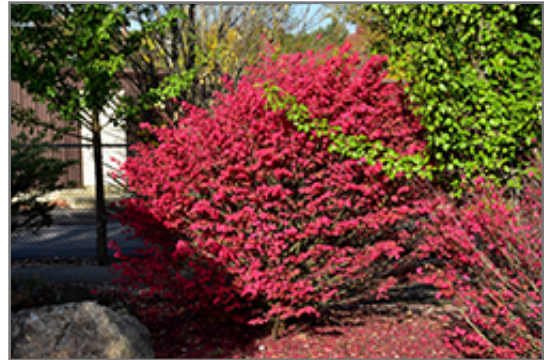
Little Moses Burning Bush in fall