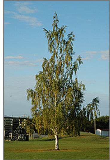
Cutleaf Weeping Birch