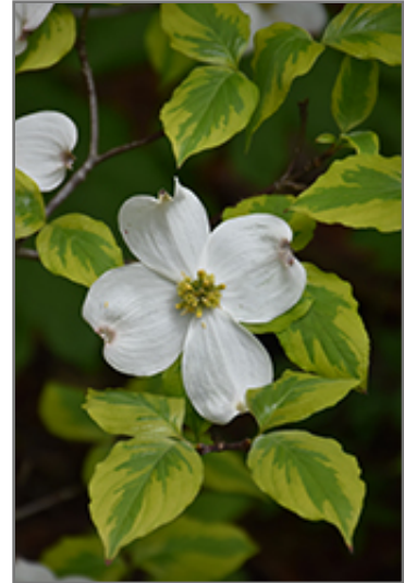
Rainbow Flowering Dogwood flowers

This tree does best in full sun to partial shade. You may want to keep it away from hot, dry locations that receive direct afternoon sun or which get reflected sunlight, such as against the south side of a white wall. It requires an evenly moist well-drained soil for optimal growth, but will die in standing water. It is very fussy about its soil conditions and must have rich, acidic soils to ensure success, and is subject to chlorosis (yellowing) of the foliage in alkaline soils. It is quite intolerant of urban pollution, therefore inner city or urban streetside plantings are best avoided, and will benefit from being planted in a relatively sheltered location. Consider applying a thick mulch around the root zone in winter to protect it in exposed locations or colder microclimates. This is a selection of a native North American species.