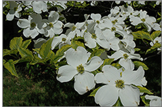
Rainbow Flowering Dogwood flowers

This is a relatively low maintenance tree, and should only be pruned after flowering to avoid removing any of the current season's flowers. It is a good choice for attracting birds to your yard. Gardeners should be aware of the following characteristic(s) that may warrant special consideration;