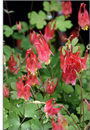
Little Lanterns Columbine flowers

Little Lanterns Columbine will grow to be only 6 inches tall at maturity extending to 10 inches tall with the flowers, with a spread of 10 inches. Its foliage tends to remain low and dense right to the ground. It grows at a medium rate, and under ideal conditions can be expected to live for approximately 5 years. As an herbaceous perennial, this plant will usually die back to the crown each winter, and will regrow from the base each spring. Be careful not to disturb the crown in late winter when it may not be readily seen!