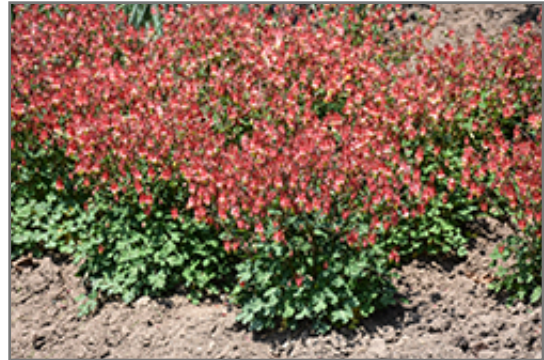
Little Lanterns Columbine in bloom