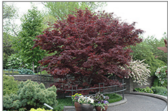
Bloodgood Japanese Maple