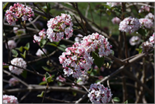
Koreanspice Viburnum flowers