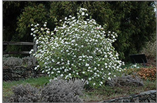
Koreanspice Viburnum in bloom

This is a relatively low maintenance shrub, and should only be pruned after flowering to avoid removing any of the current season's flowers. It is a good choice for attracting birds to your yard, but is not particularly attractive to deer who tend to leave it alone in favor of tastier treats. It has no significant negative characteristics.