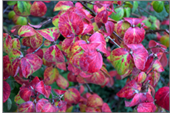
Koreanspice Viburnum in fall

This shrub does best in full sun to partial shade. It prefers to grow in average to moist conditions, and shouldn't be allowed to dry out. It is not particular as to soil type or pH. It is somewhat tolerant of urban pollution. This species is not originally from North America.