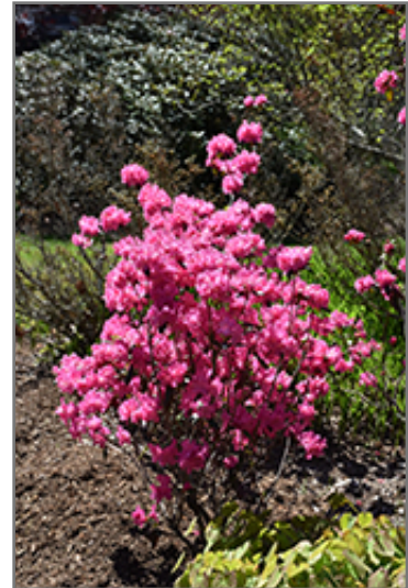
Landmark Rhododendron in bloom