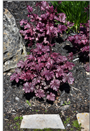
Midnight Rose Coral Bells