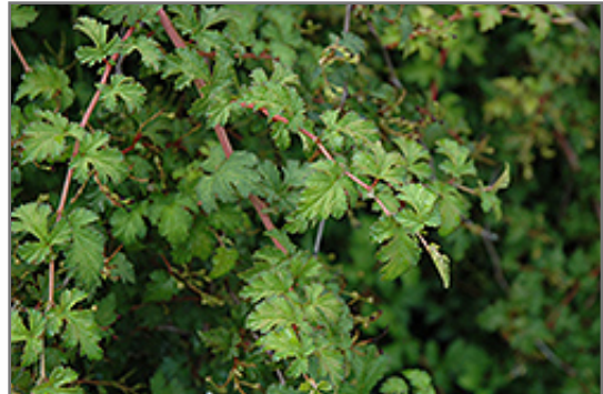
Cutleaf Stephanandra foliage