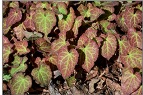
Froehnleiten Bishop's Hat foliage