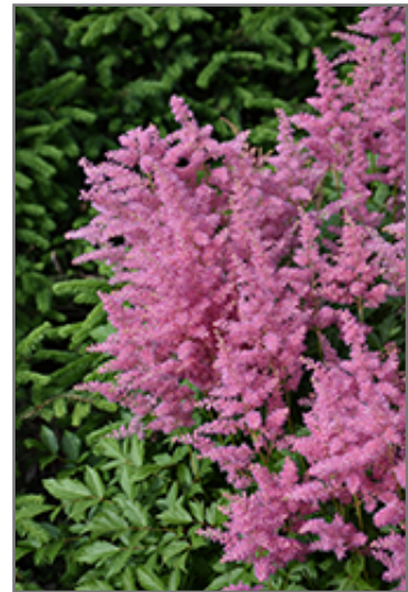
Visions in Pink Chinese Astilbe flowers

Visions in Pink Chinese Astilbe is recommended for the following landscape applications;