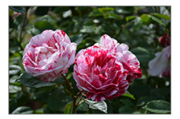
Scentimental Rose flowers

This shrub will require occasional maintenance and upkeep, and is best pruned in late winter once the threat of extreme cold has passed. Gardeners should be aware of the following characteristic(s) that may warrant special consideration;