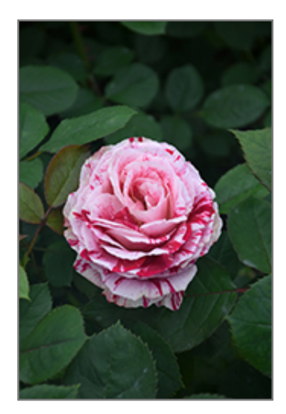
Scentimental Rose flowers