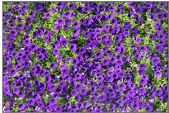
Supertunia Mini Vista Ultramarine Petunia flowers