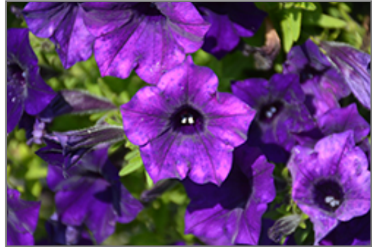
Supertunia Mini Vista Ultramarine Petunia flowers

Supertunia Mini Vista Ultramarine Petunia is a dense herbaceous annual with a trailing habit of growth, eventually spilling over the edges of hanging baskets and containers. Its medium texture blends into the garden, but can always be balanced by a couple of finer or coarser plants for an effective composition.