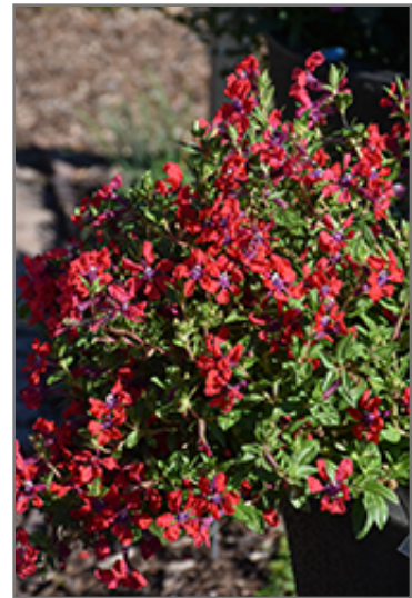
Totally Tempted Watermelon Wine Cuphea flowers