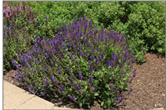
Noble Knight Sage in bloom