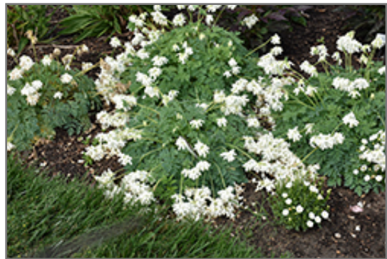
White Diamonds Fern-leaved Bleeding Heart in bloom