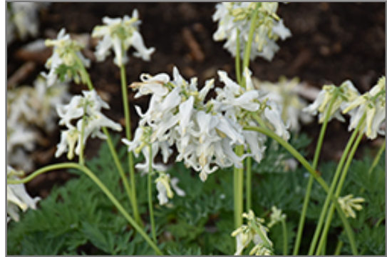
White Diamonds Fern-leaved Bleeding Heart flowers

White Diamonds Fern-leaved Bleeding Heart is recommended for the following landscape applications;