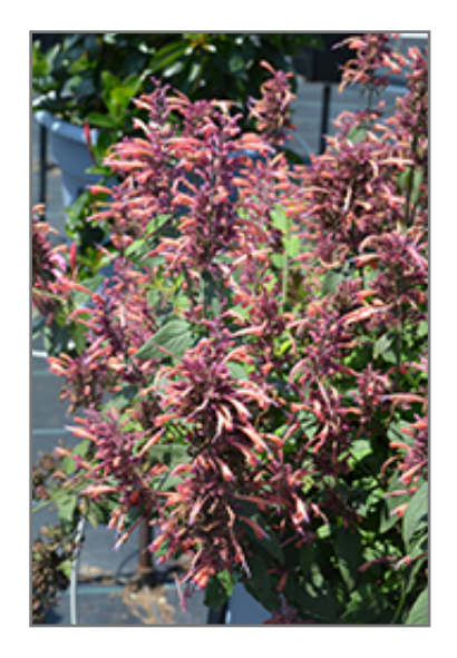
Guava Lava Anise Hyssop flowers