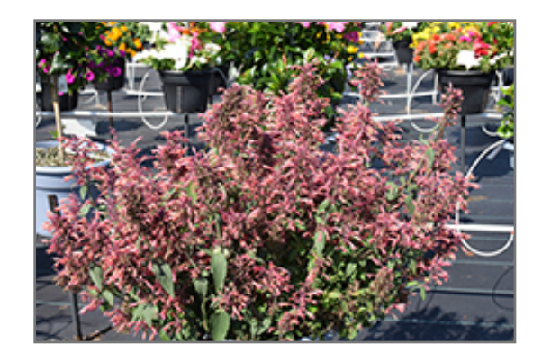
Guava Lava Anise Hyssop in bloom