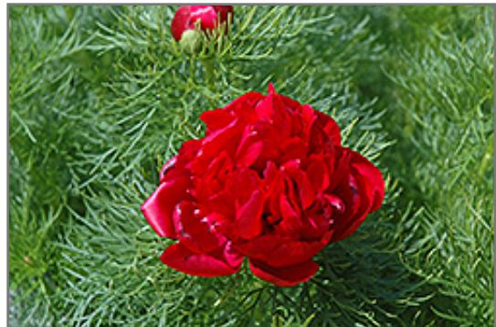
Double Fernleaf Peony flowers