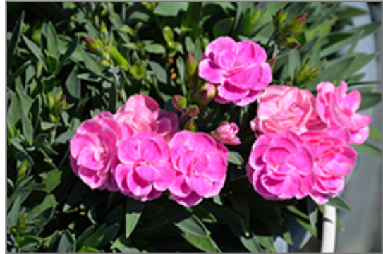
Peman Fancy Lilac Border Carnation flowers