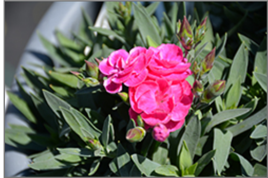
Peman Fancy Cerise Border Carnation flowers