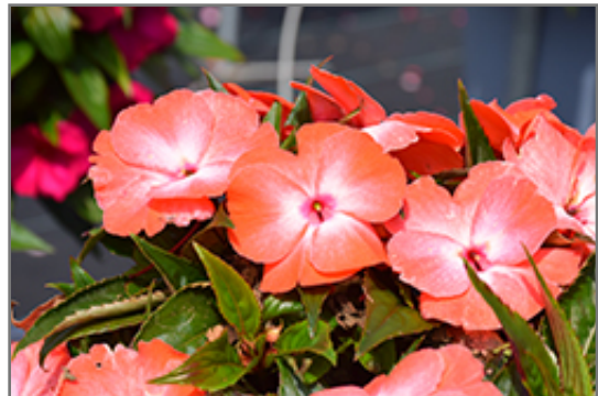
Petticoat Orange Orchid New Guinea Impatiens flowers