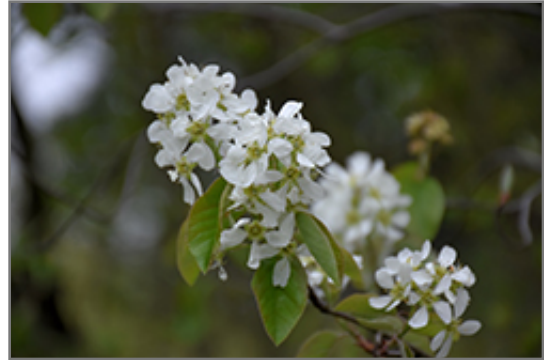
Saskatoon flowers

Saskatoon is a multi-stemmed deciduous shrub with an upright spreading habit of growth. Its relatively fine texture sets it apart from other landscape plants with less refined foliage.