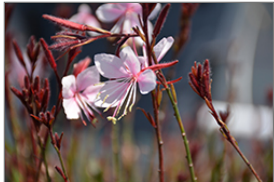
Steffi Blush Pink Gaura flowers

Steffi Blush Pink Gaura is recommended for the following landscape applications;