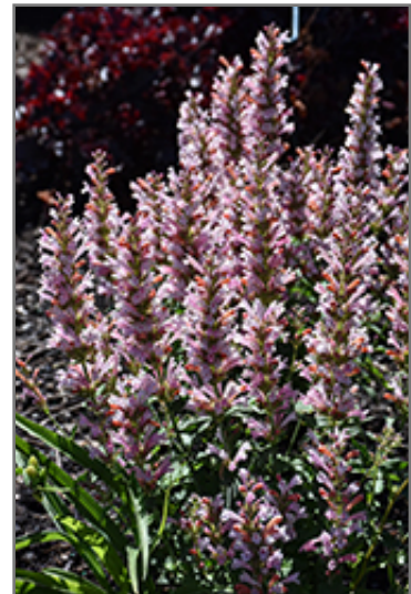
Pink Pearl Hyssop flowers

This is a relatively low maintenance plant, and is best cleaned up in early spring before it resumes active growth for the season. It is a good choice for attracting bees, butterflies and hummingbirds to your yard, but is not particularly attractive to deer who tend to leave it alone in favor of tastier treats. It has no significant negative characteristics.