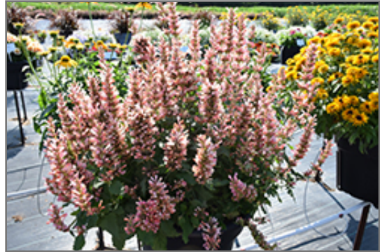
Pink Pearl Hyssop in bloom

Pink Pearl Hyssop will grow to be about 8 inches tall at maturity extending to 16 inches tall with the flowers, with a spread of 16 inches. It grows at a fast rate, and under ideal conditions can be expected to live for approximately 6 years. As an herbaceous perennial, this plant will usually die back to the crown each winter, and will regrow from the base each spring. Be careful not to disturb the crown in late winter when it may not be readily seen!