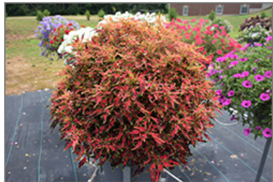
ColorBlaze Mini Me Watermelon Coleus