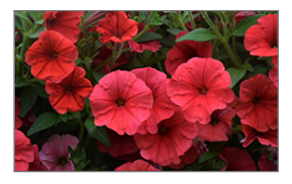
Supertunia Mini Vista Scarlet Petunia flowers

Supertunia Mini Vista Scarlet Petunia is recommended for the following landscape applications;