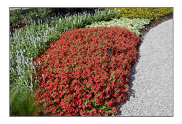
Supertunia Mini Vista Scarlet Petunia in bloom