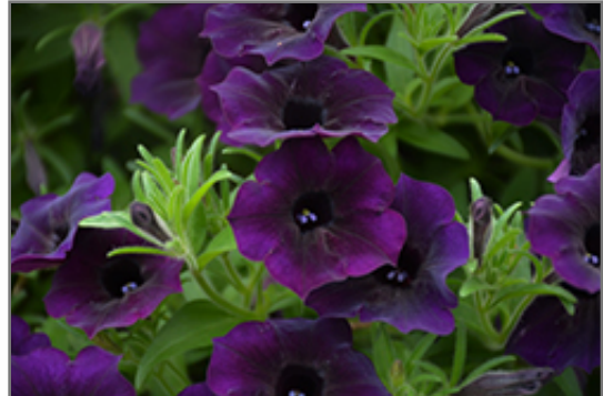
Supertunia Mini Vista Midnight Petunia flowers

This plant will require occasional maintenance and upkeep. Trim off the flower heads after they fade and die to encourage more blooms late into the season. It is a good choice for attracting butterflies and hummingbirds to your yard, but is not particularly attractive to deer who tend to leave it alone in favor of tastier treats. It has no significant negative characteristics.