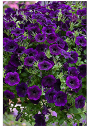
Supertunia Mini Vista Midnight Petunia flowers

This plant will require occasional maintenance and upkeep. Trim off the flower heads after they fade and die to encourage more blooms late into the season. It is a good choice for attracting butterflies and hummingbirds to your yard, but is not particularly attractive to deer who tend to leave it alone in favor of tastier treats. It has no significant negative characteristics.