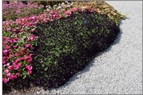
Supertunia Mini Vista Midnight Petunia in bloom

Supertunia Mini Vista Midnight Petunia is a fine choice for the garden, but it is also a good selection for planting in outdoor containers and hanging baskets. Because of its trailing habit of growth, it is ideally suited for use as a 'spiller' in the 'spiller-thriller-filler' container combination; plant it near the edges where it can spill gracefully over the pot. Note that when growing plants in outdoor containers and baskets, they may require more frequent waterings than they would in the yard or garden.