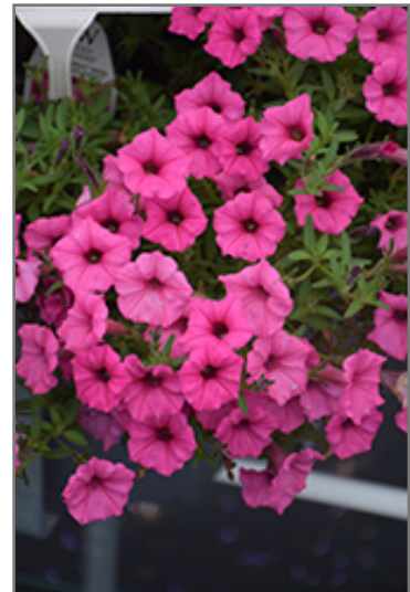
Supertunia Mini Vista Hot Pink Petunia flowers

Supertunia Mini Vista Hot Pink Petunia is recommended for the following landscape applications;