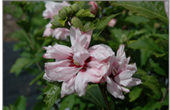
Blushing Bride Rose Of Sharon flowers

Blushing Bride Rose Of Sharon is recommended for the following landscape applications;