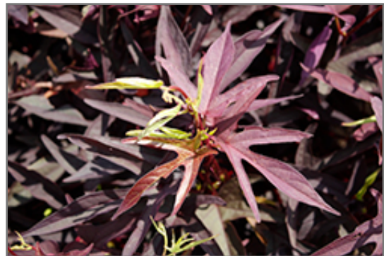
Sweet Caroline Upside Black Coffee Sweet Potato Vine foliage