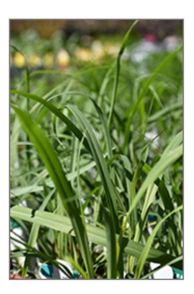
Lemon Grass foliage

This plant is quite ornamental as well as edible, and is as much at home in a landscape or flower garden as it is in a designated herb garden. It should only be grown in full sunlight. It does best in average to evenly moist conditions, but will not tolerate standing water. It is not particular as to soil pH, but grows best in rich soils. It is highly tolerant of urban pollution and will even thrive in inner city environments. Consider applying a thick mulch around the root zone in winter to protect it in exposed locations or colder microclimates. This species is not originally from North America. It can be propagated by division.