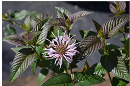
Midnight Oil Eastern Beebalm flowers

Midnight Oil Eastern Beebalm is recommended for the following landscape applications;