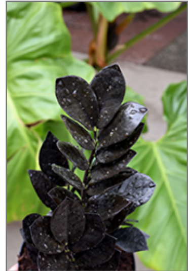
Raven ZZ Plant flowers