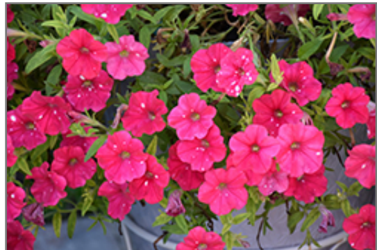
HeadlinerStrawberry Sky Petunia flowers