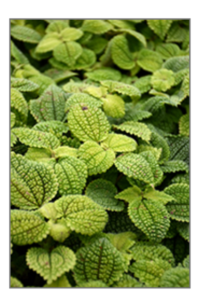
Moon Valley Pilea foliage