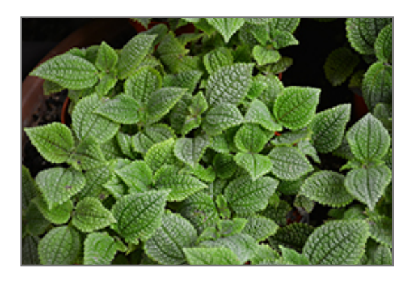
Moon Valley Pilea foliage