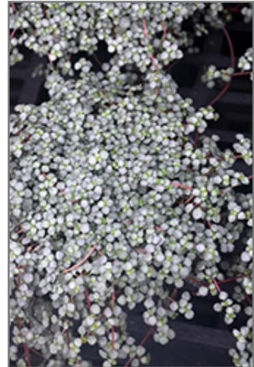
Aquamarine Pilea foliage