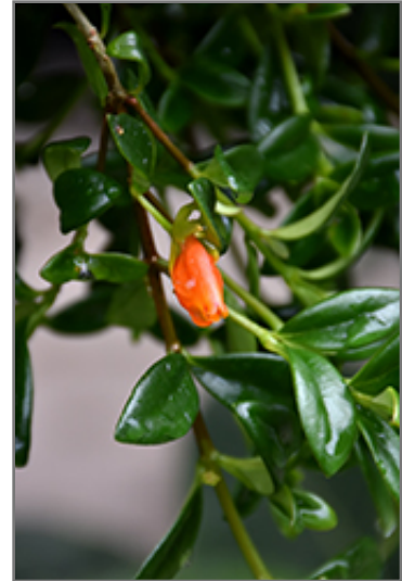
Goldfish Plant flowers

This is a dense herbaceous evergreen houseplant with a trailing habit of growth, eventually spilling over the edges of hanging baskets and containers. This plant can be pruned at any time to keep it looking its best.