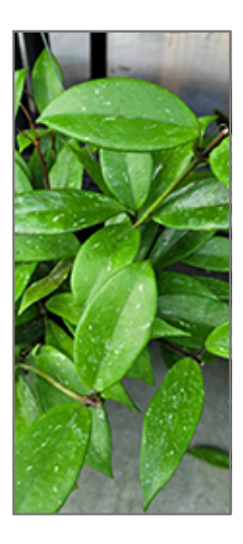
Hoya Pubicalyx foliage

When grown indoors, Hoya Pubicalyx can be expected to grow to be about 6 feet tall at maturity, with a spread of 24 inches. It grows at a medium rate, and under ideal conditions can be expected to live for approximately 10 years. This houseplant should be situated in a location that that gets indirect sunlight at most, although it will usually require a more brightly-lit environment than what artificial indoor lighting alone can provide. It is very adaptable to both dry and moist soil, but will not tolerate any standing water. The surface of the soil shouldn't be allowed to dry out completely, and so you should expect to water this plant once and possibly even twice each week. Be aware that your particular watering schedule may vary depending on its location in the room, the pot size, plant size and other conditions; if in doubt, ask one of our experts in the store for advice. It will benefit from a regular feeding with a general-purpose fertilizer with every second or third watering. It is not particular as to soil pH, but grows best in rich soil. Contact the store for specific recommendations on pre-mixed potting soil for this plant.