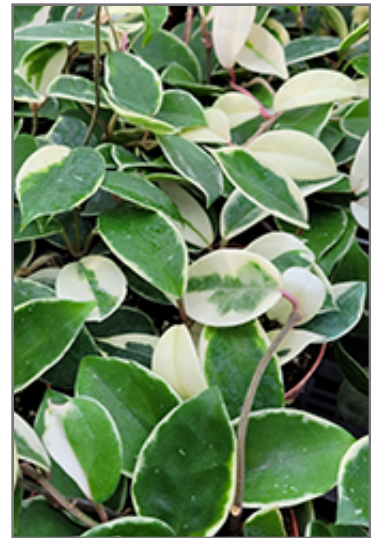
Krimson Queen Wax Plant foliage

This is an herbaceous houseplant with a spreading, ground-hugging habit of growth. This plant may benefit from an occasional pruning to look its best.