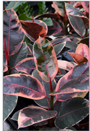
Ruby Rubber Tree foliage

When grown indoors, Ruby Rubber Tree can be expected to grow to be about 8 feet tall at maturity, with a spread of 6 feet. It grows at a medium rate, and under ideal conditions can be expected to live for approximately 50 years. This houseplant will do well in a location that gets either direct or indirect sunlight, although it will usually require a more brightly-lit environment than what artificial indoor lighting alone can provide. It prefers dry to average moisture levels with very well-drained soil, and may die if left in standing water for any length of time. This plant should be watered when the surface of the soil gets dry, and will need watering approximately once each week. Be aware that your particular watering schedule may vary depending on its location in the room, the pot size, plant size and other conditions; if in doubt, ask one of our experts in the store for advice. It will benefit from a regular feeding with a general-purpose fertilizer with every second or third watering. It is not particular as to soil type or pH; an average potting soil should work just fine.