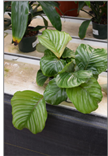
Orbifolia Prayer Plant in full