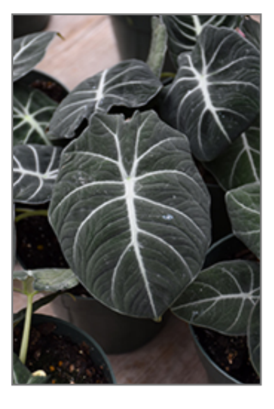
Mythic Black Velvet Jewel Alocasia foliage

This is an open herbaceous evergreen houseplant with an upright spreading habit of growth. This plant usually looks its best without pruning, although it will tolerate pruning.